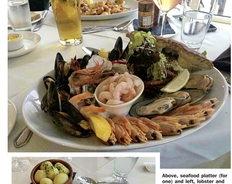
one) and left, lobster and