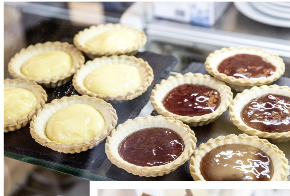
Cakes and baked goods are served throughout the day.