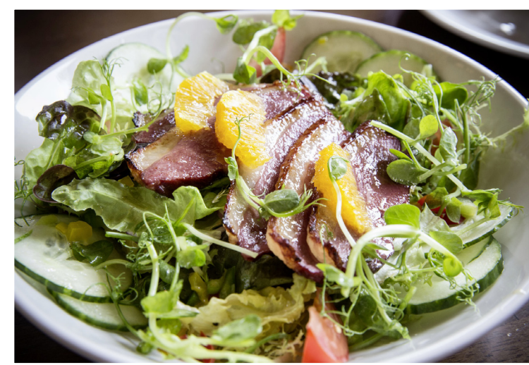
Honey and orange smoked duck breast.